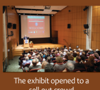
The exhibit opened to a sell-out crowd