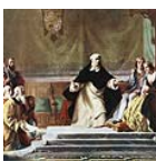
Jews' expulsion from Spain, 1492